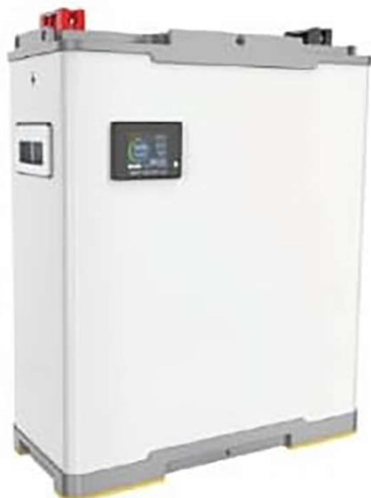
LiFePO4 Battery Pack Smart -BCT- V-24-200/250/300