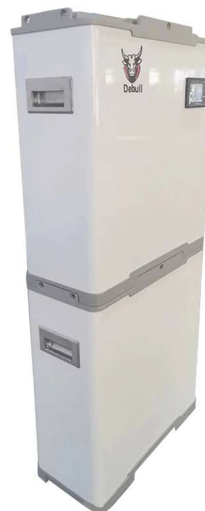
LiFePO4 Battery Pack Smart -BCT- V-48-200/250/300